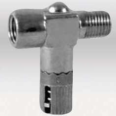
894 (CPT No. CA 085203)

For tools with 1/4" threaded inlet. Spring loaded lock type arrangement stays at your setting and restricts air flow to suit your needs.