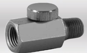
889 Brass 890 Aluminum

For tools with 1/4" threaded inlet. Spring loaded lock type arrangement stays at your setting and restricts air flow to suit your needs.